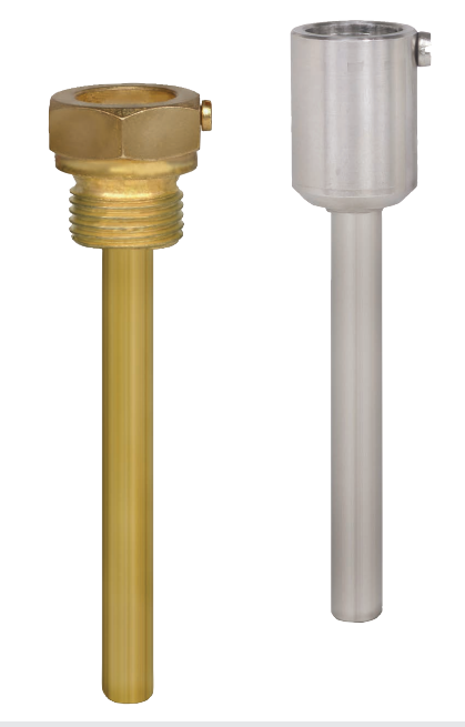
Fig. left: Thermowell with thread Fig. right: Thermowell with welding stud